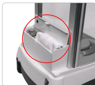
Rear tool box includes SS test weight and hand gloves