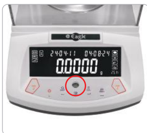
User friendly key operations & Level indicator