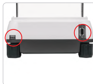
USB port & RS232 port