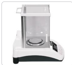
Anti static large glass draft shield with carrying handle