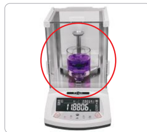
Optional Density measurement Kit