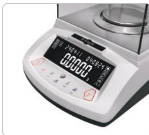
Reverse LCD display with 23 mm digit height