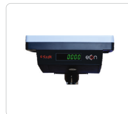
OPT 013 Built in Rear Display