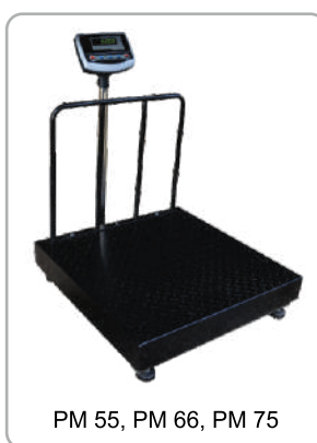
PM 55, PM 66, PM 75