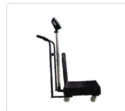
OPT 015 to 018 Trolley with Handle