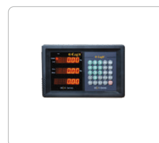
OPT 082 Counting Indicator