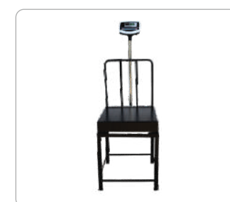
OPT 073 to 076 Stand of Height 1000 mm