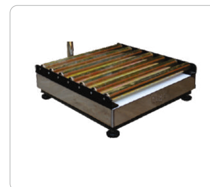
OPT 029 to 033 Roller with Bearings