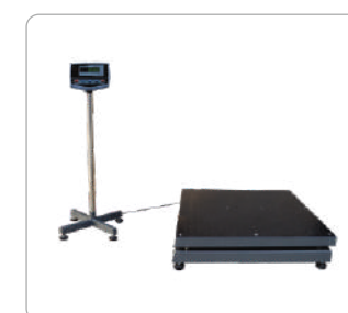
OPT 108 X Stand