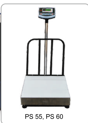
PS 55, PS 60