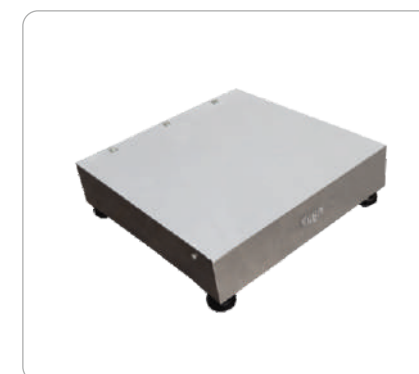
OPT 060 SS Pan 1.2 mm Thick