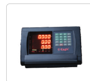
OPT 083 Price Computing Indicator