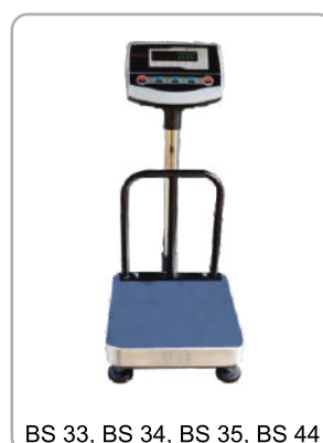
BS 33, BS 34, BS 35, BS 44