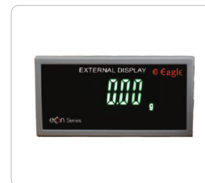
OPT 013 Built in Rear Display